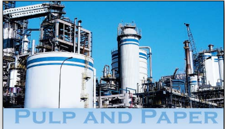
Chile Pulp & Paper Mills